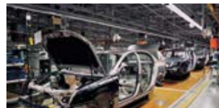
PERM4 | ENGINEERING