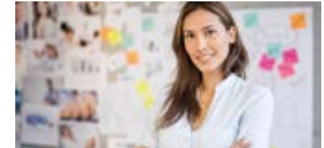
PERM4 | MARKETING