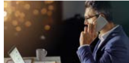
PERM4 | SALES