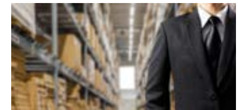
PERM4 | SUPPLY CHAIN MANAGEMENT