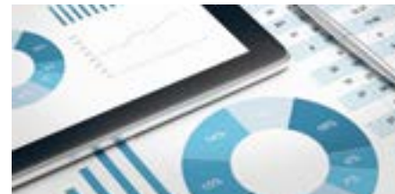
PERM4 | FINANCE