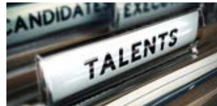
PERM4 | HR