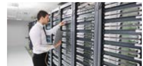
PERM4 | IT/TK