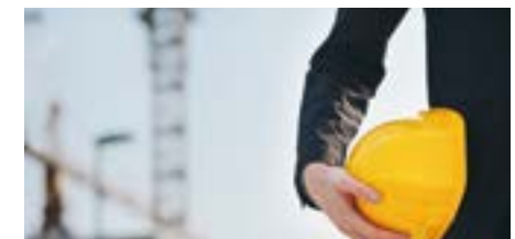
PERM4 | CONSTRUCTION/PROPERTY